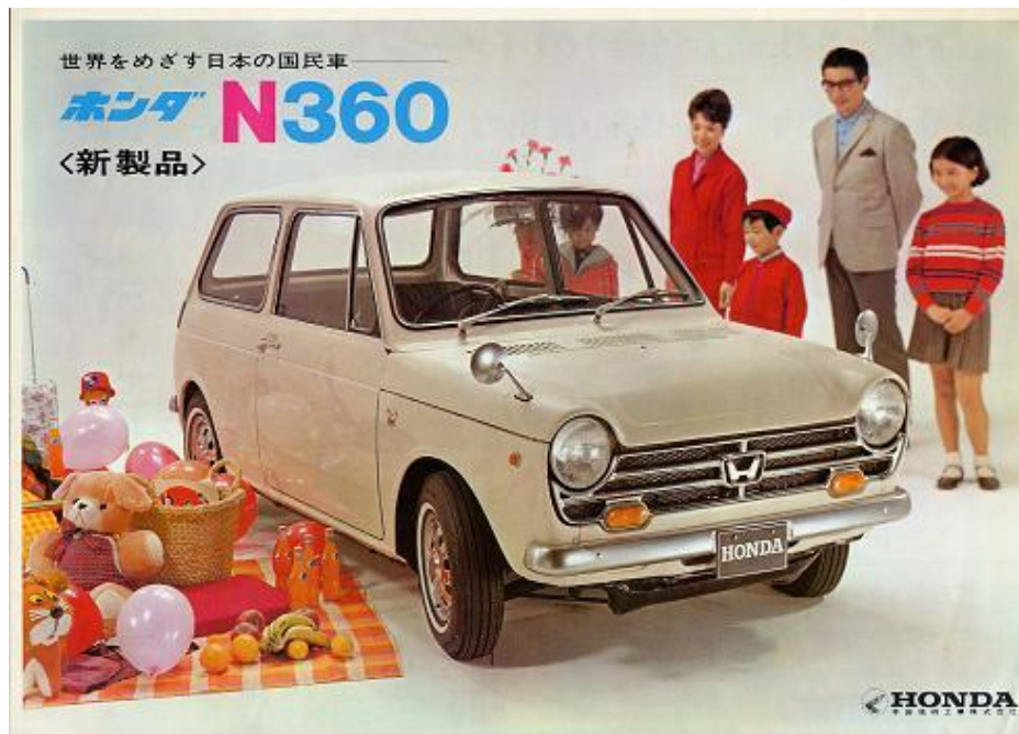
【1966 Catalog cover for 13th Tokyo Motor Show distribution】

"N360" was sold in 1967, and it was a top seller of a minicar instantly. The model which are sedan station wagon truck* and a leisure vehicle, etc. as "N series" was produced. Those contributed to a motorization of our country big, and even the whole country every corner were every people's car all Japan, and ran about.